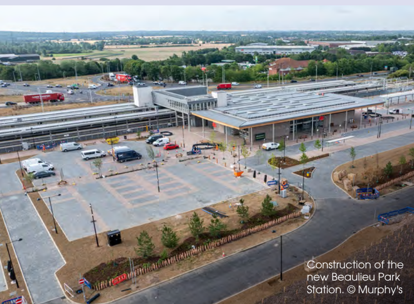
Construction of the new Beaulieu Park Station.