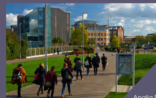
Anglia Ruskin University.