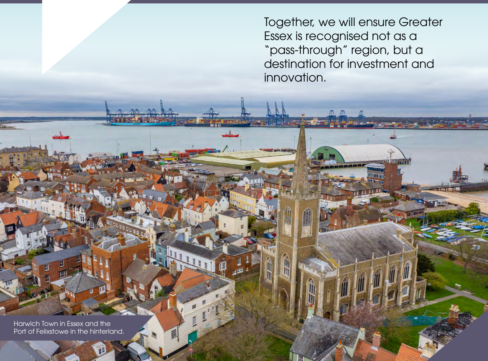
Harwich Town in Essex and the Port of Felixstowe in the hinterland.