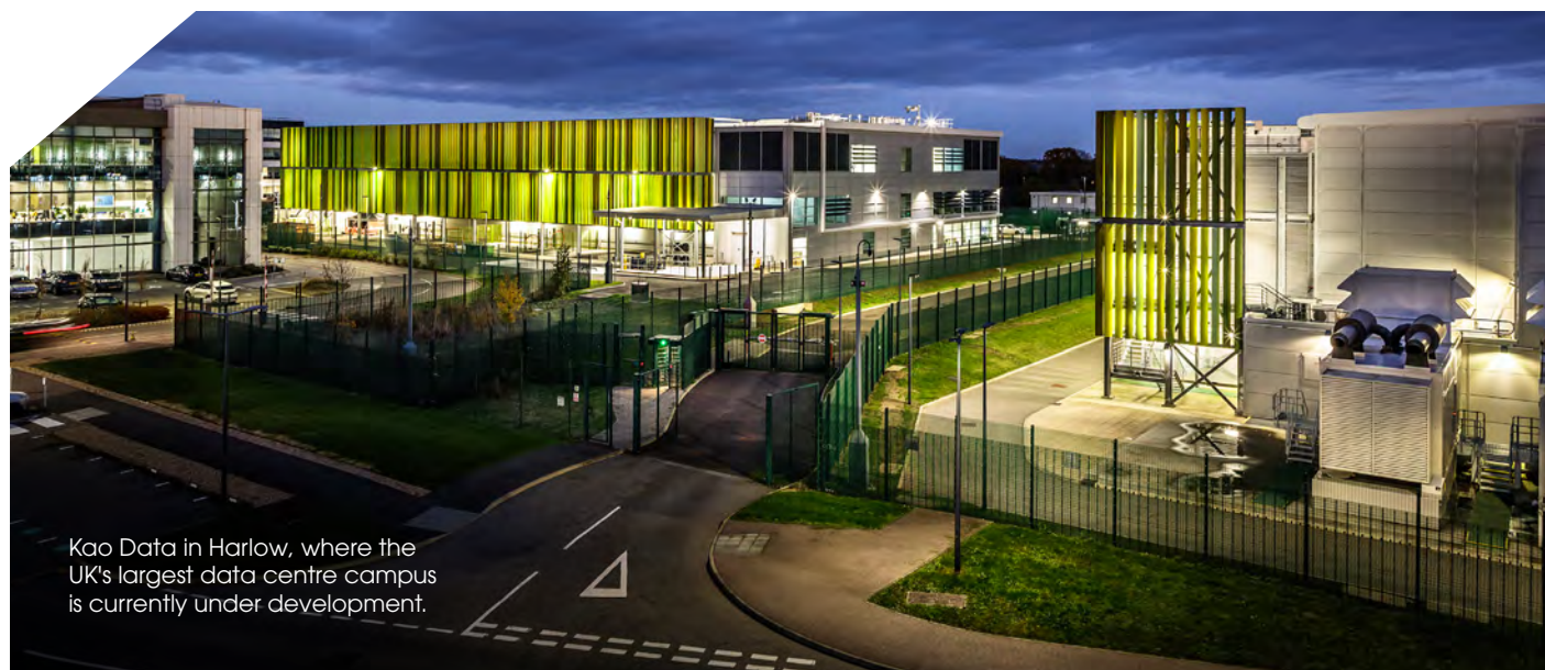
Kao Data in Harlow, where the UK's largest data centre campus is currently under development.