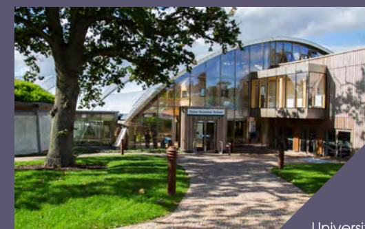
University of Essex Business School.